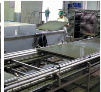
Rollaway cover provides easy access for inspection and maintenance