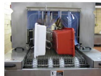
Allows multiple lane operation and adjustability for a variety of sizes while guiding totes securely