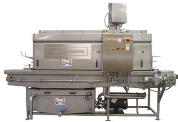
Compact and efficient, with high capacity