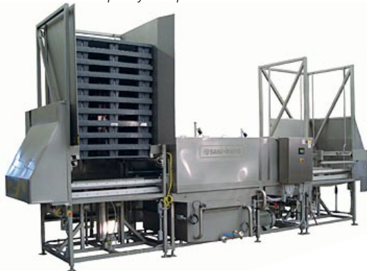
Pallet Washer with synchronized de-stack / stacking, sized for capacity and process